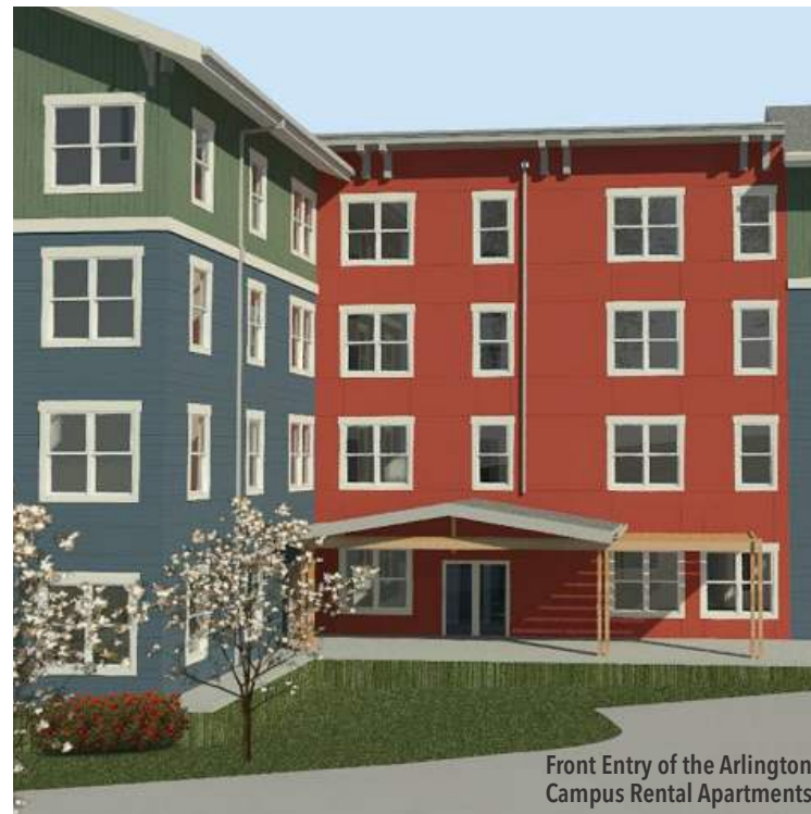
Front Entry of the Arlington Campus Rental Apartments