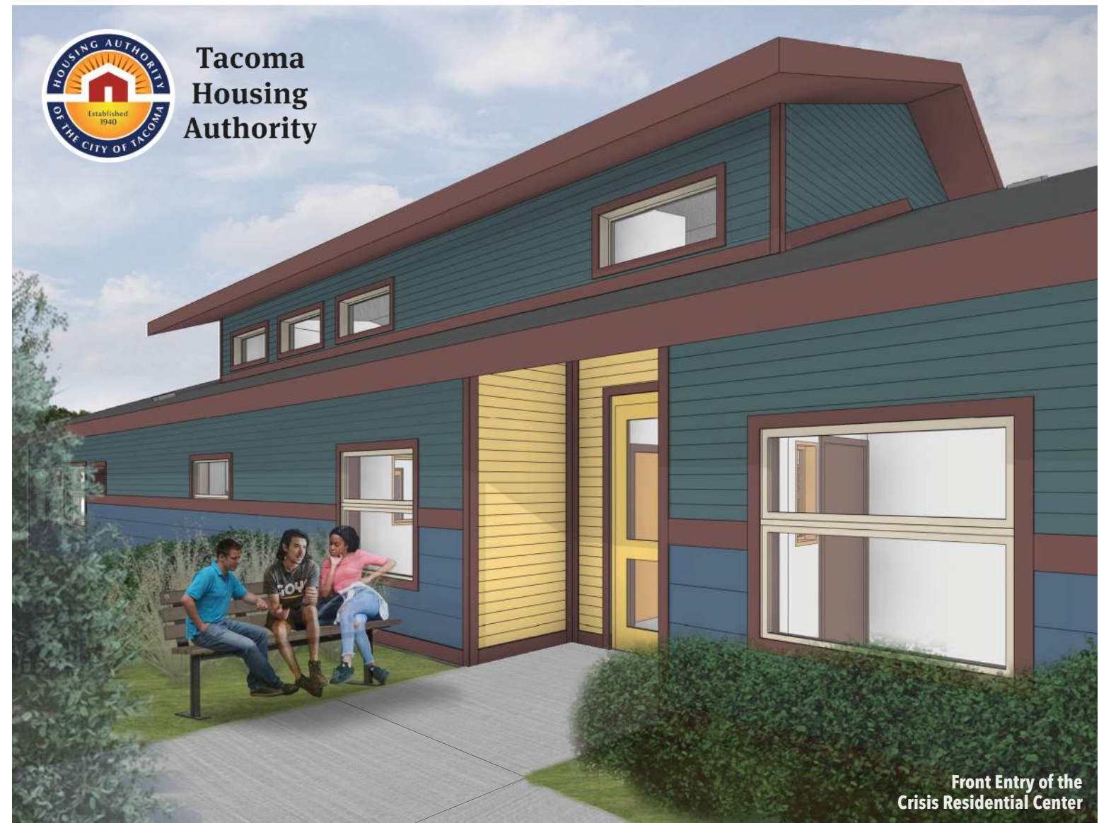
Front Entry of the Crisis Residential Center